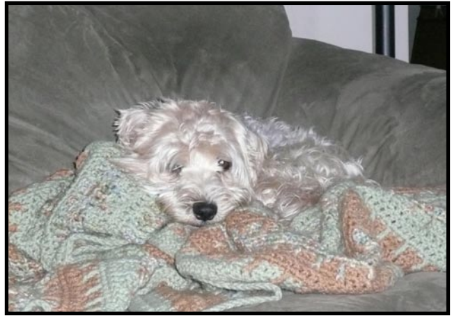
Juju, recuperating at home, curled up in a favorite chair.