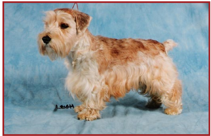
A well-groomed Lucas is a beautiful sight to behold as the photo of Frost's Tippy Toes above is a testament to.

Hand stripping requires considerably more time than grooming with clippers. This means it will cost a lot more to have it done professionally. This is also a reason that many professional groomers decline to offer the service. But it is a skill you can learn to do on your own with patience and practice.